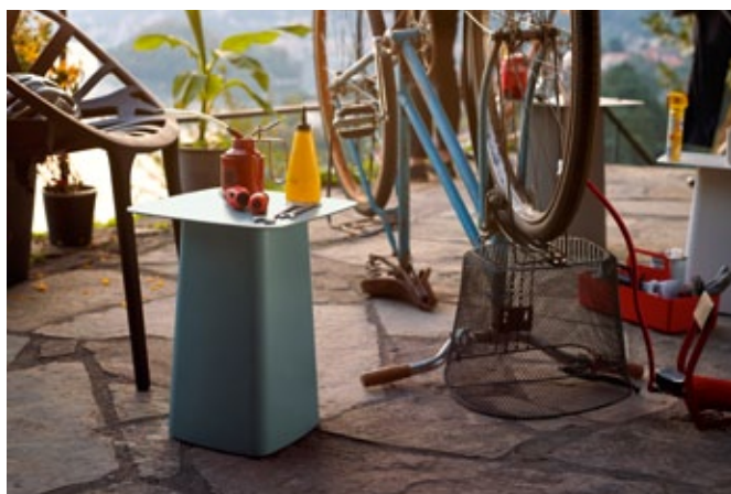
Metal Side Table (Outdoor)

In the powder-coated version with a fine textured finish, the Metal Side Tables serve as weatherproof occasional tables for balcony and garden. The tables make a perfect companion for the indoor-outdoor Waver armchair, which is available with bases in matching colours.